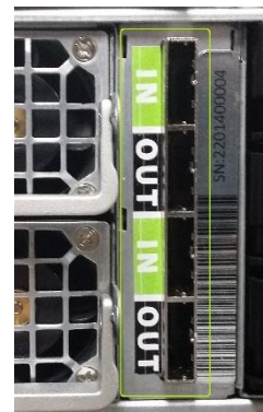
Figure 2 – Array Shelf Connections

Figure 2 shows the array shelf connections.