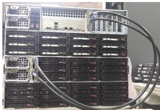
Figure 3 – Controller / Shelf Cabled System

Once you are finished, the cable connections should look similar to the following: