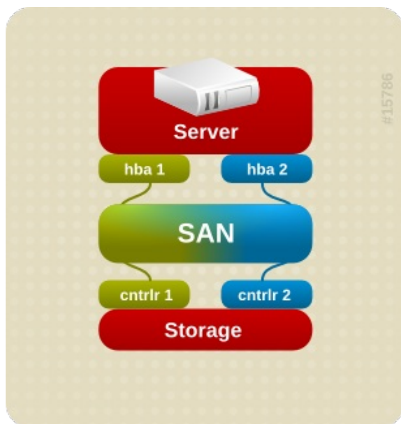
Figure 1.3. Active/Active Multipath Configuration with One RAID Device